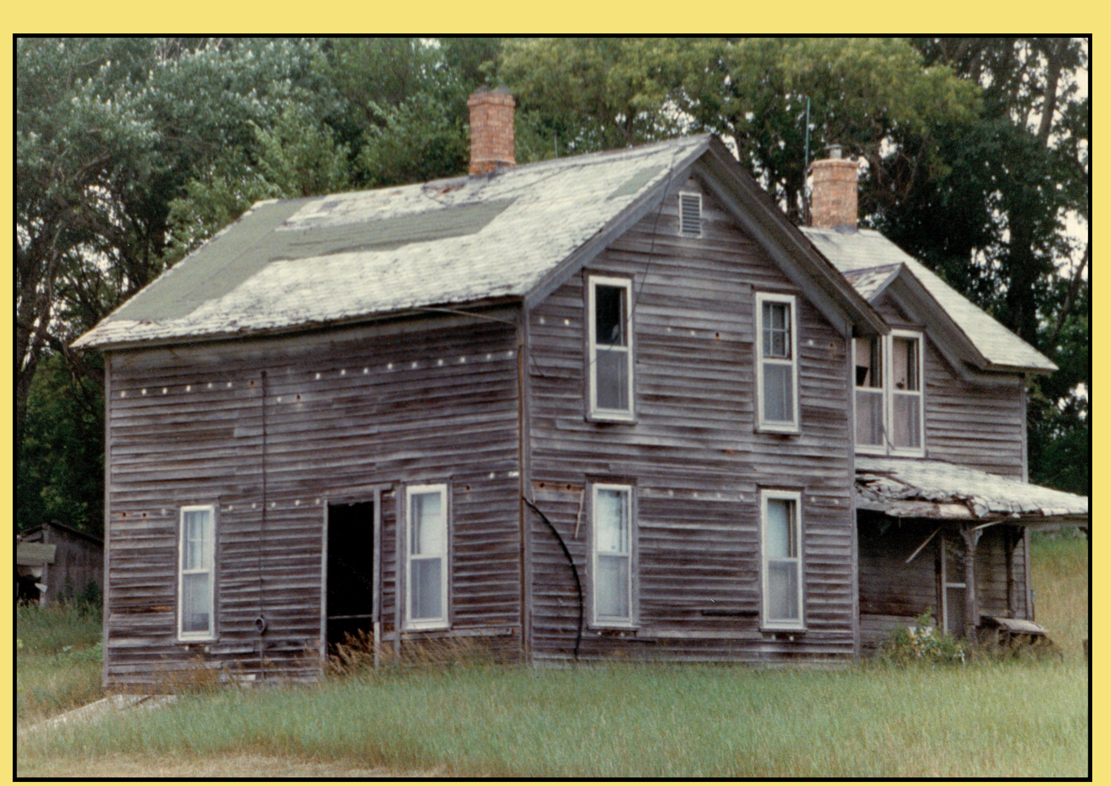
All that remains of the original house is the stone foundation. No well for a water supply was ever needed as spring water was piped directly into the basement. Above: Picture is the east and south sides of the house. Below: is the west and north sides of the house.