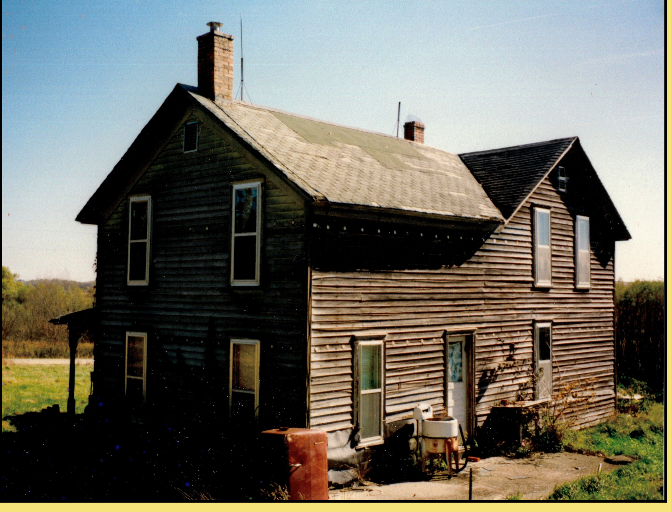
Pictured below is the old machine shed which was located just west of the information kiosk.